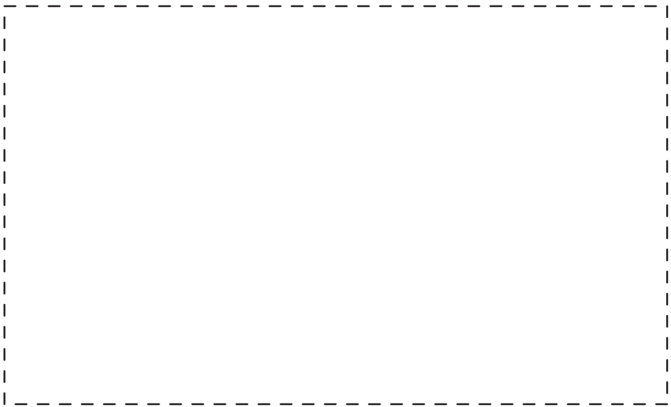
Imprint Size: 5" x 3" 100%