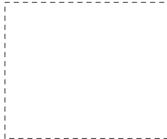
Embroidery Size: 3" x 2.5" 100%

Disclaimer: This proof is primarily used to display imprint size and location only. Color proofs are not a guaranteed representation of actual imprint color and product. PMS matching not available on full color / four color process artwork. PMS colors shown may vary based on computer monitor used. If PMS color is not noted on order, standard ink color will be used from Standard Ink Color Chart. Chart link: http://www.stopngoline.com/pdf-product/stdimprintcolors.pdf PMS Color Match cannot be guaranteed to match, only as close as possible, particularly on dark color items or stainless steel.